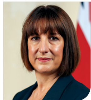
Official portrait of Rachel Reeves MP, by Lauren Hurley, licensed under Open Government Licence v3.0

The OBR, blushing from its pre-emptive publication of documents on the day, at least managed to summarise matters neatly: "...the Budget delivers a frontloaded increase in spending of £9 billion and backloaded increase in taxes of £26 billion".