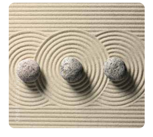
SELF-INVESTED PERSONAL PENSIONS (SIPPS)

The investment option that lets you control how and where your money is invested