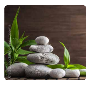
THE POWER OF YOUR PENSION

The investment option that lets you control how and where your money is invested