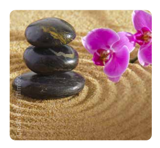
THE TAX BURDEN ON HIGH INCOME