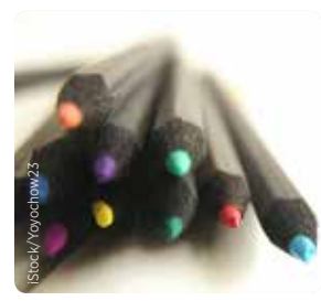
VALUE AND TIMING EXPENDITURE

Writing down allowances and expenditure over the limits